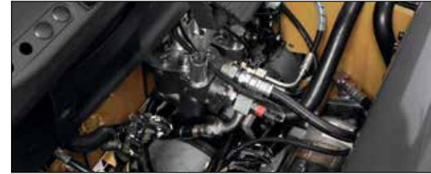
Factory warranty for added protection