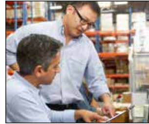
Custom financing packages