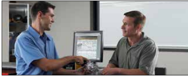
Local service and support