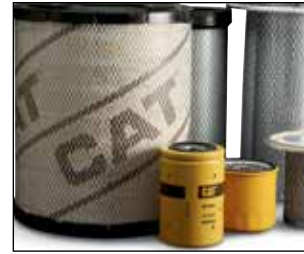
Genuine OEM parts